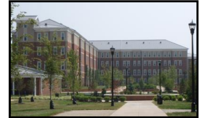
Fort Belvoir, Warrior in Transition Barracks