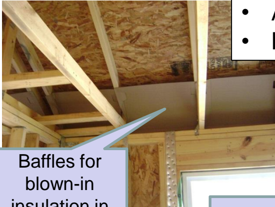
Baffles for blown-in insulation in place