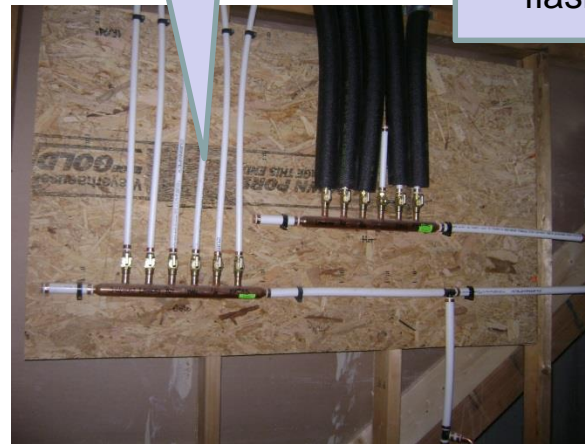
Well-organized professional piping job