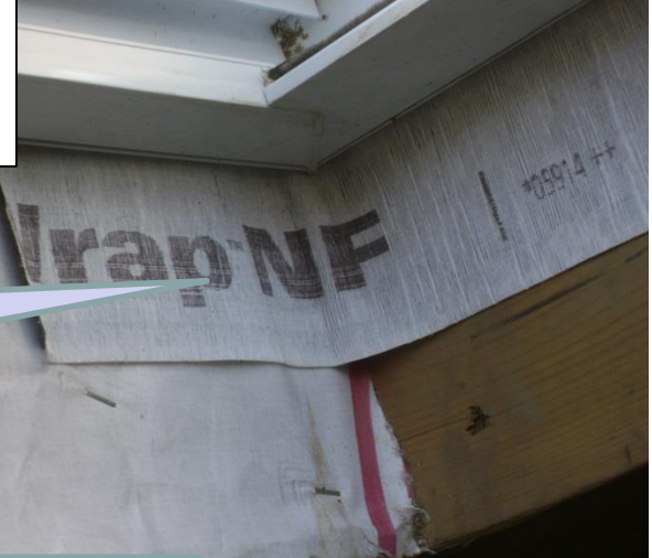
Window sill properly flashed