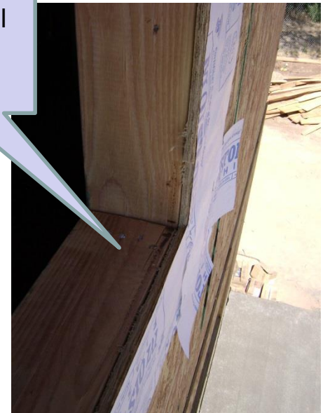
Window sill with no flashing