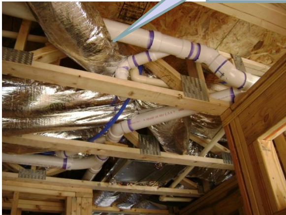
Crushed duct in congested installation